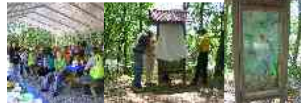
Unveiling of mural at Lafarge Quarry Nature Trail