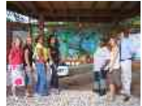
Mural installed at Lawrence Shoals Park