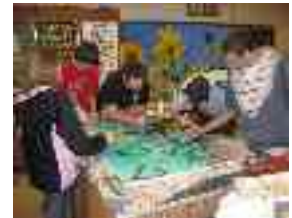
Putnam County High School Classroom

This fall, STMA's Arts Outreach Program will begin the third year of Oceans of Possibilities with Morgan County Elementary and Middle schools. Students will work with local artists to create a large mural that will be permanently displayed at a public place in Morgan County. The Madison Aquatic Center, now under construction, is the planned venue.